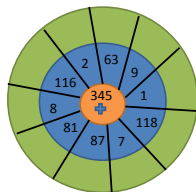
Addition Circle Drill