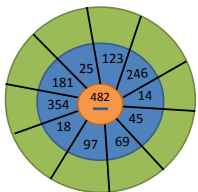
Subtraction Circle Drill